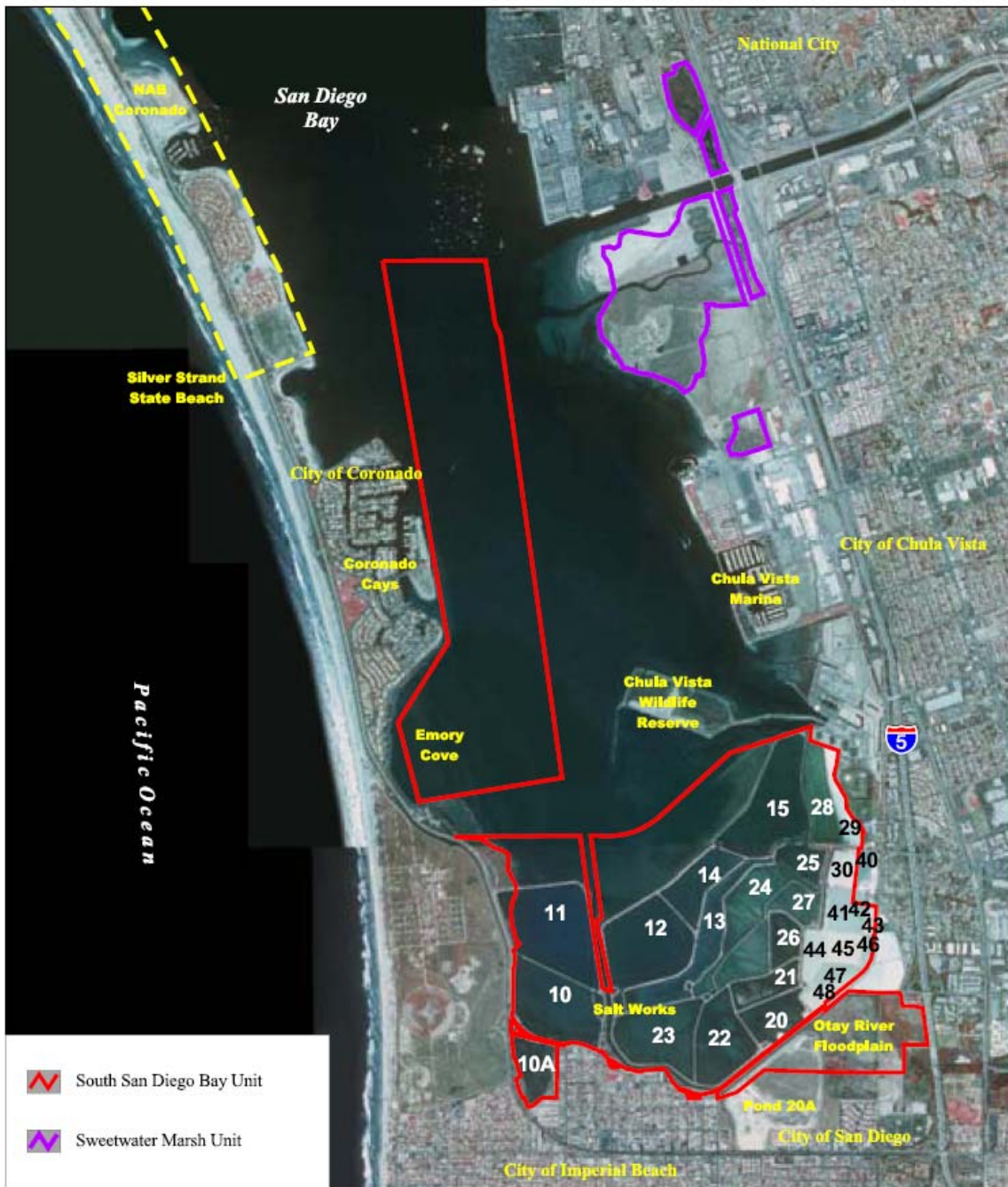
Figure 2 San Diego Bay NWR Comprehensive Conservation Plan Project Study Area (Area of Potential Effects)