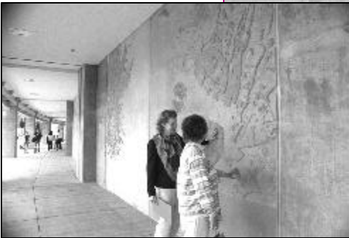
Braaksma's reliefs were molded into 5-ton concrete panels 9 x 14 feet in size, which were assembled into a 500-foot long wall connecting Terminals 1 and 2.