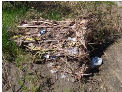
Some of the litter from urban creeks (above) ends up on South Bay shores (right), then is collected by volunteers for proper disposal (left). The rest of the trash flushes to the sea.