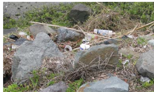
Chula Vista Marina shore prior to cleanup.

** indicates high trash accumulation during scouting trip.