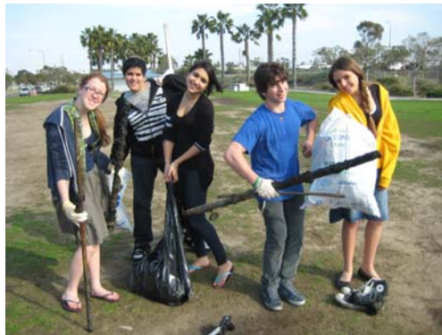
Students show their enthusiasm for keeping the bay clean.

The final cleanup at the Chula Vista Marina involved nearly 40 teenagers from a religious youth group (NCSY) and a number of community volunteers, including many staff members of