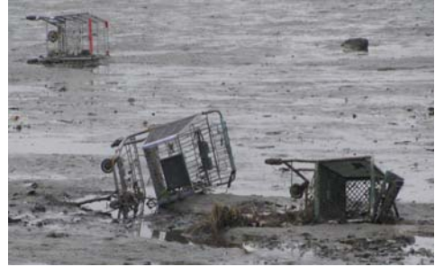
Shopping carts litter S. Bay mudflats near creek outlets

San Diego Coastkeeper distributed data cards to volunteers to gather information about the types of debris collected on the shores of San Diego Bay. However, the dataset is not a complete assessment of the debris in the bay. For example, it does not include submerged or floating items, nor does every volunteer mark down every single item they collect (especially smaller pieces). Regardless, the information we collected indicates that single-use plastics dominate the list of the “Top Ten Items Found” when considered by individual item (see Figure 3). Pieces of paper, cigarette butts, and other plastic pieces also appear on the list. It should also be noted that the most common items found by weight are: metal pieces, furniture and shopping carts.