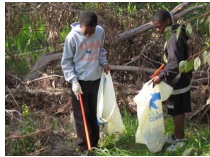
Walk the Watershed volunteers clean urban creeks

The final cleanup at the Chula Vista Marina involved nearly 40 teenagers from a religious youth group (NCSY) and a number of community volunteers, including many staff members of