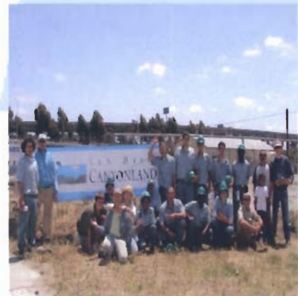
Urban Corps of San Diego County removing invasive vegetation, litter & debris and providing community service with Canyon Lands Inc.