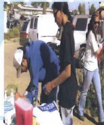
San Diego Canyon Lands Inc "Friends of Chollas Creek" Community Service Event.