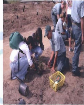
Chollas Creek Student Stream restoration Team "SSRT" Cesar Chavez Elementary School.