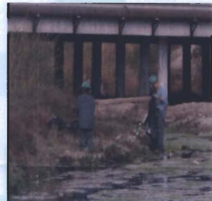
Urban Corps of San Diego Planting Native Plants with Cesar Chavez Elementary SSRT as well the removal of debris, graffiti and non-native vegetation.