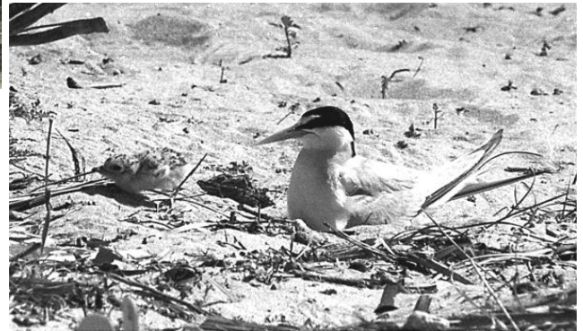
California Least Tern & chick