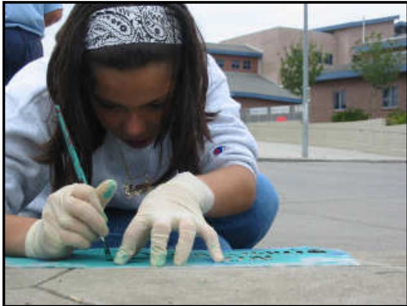
Environmental service project: Painting storm drains