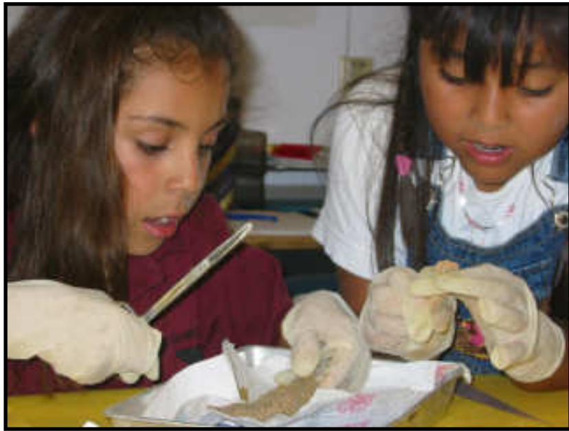
Hands-on, experiential learning in the classroom