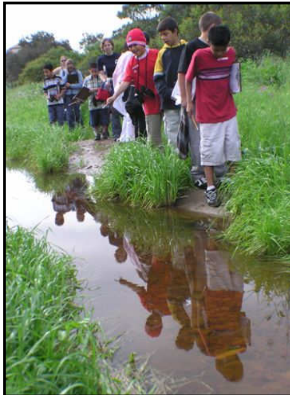
Field Trip: Exploring wetlands