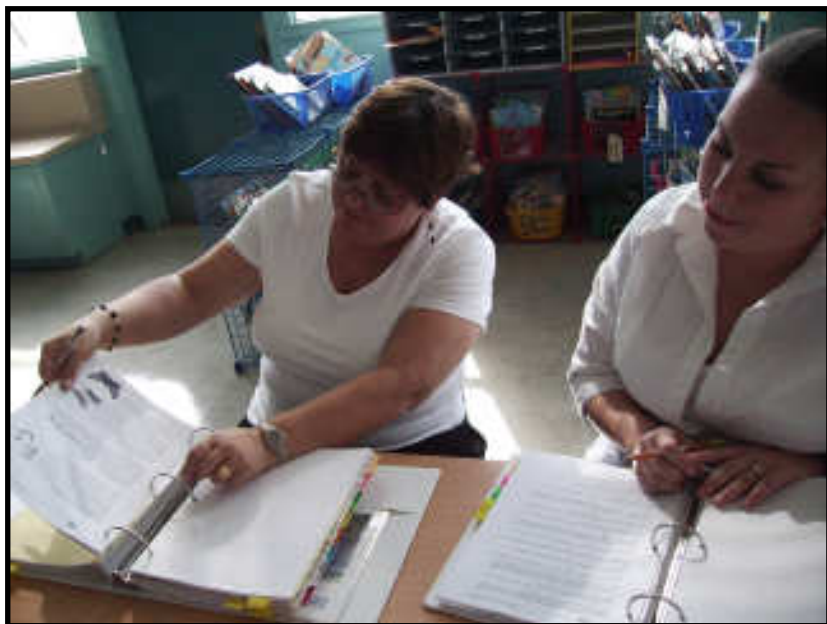
Professional development for teachers